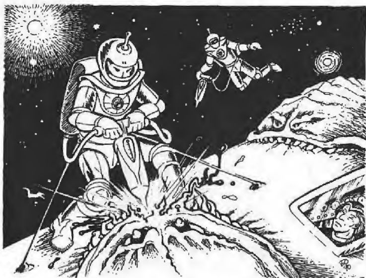
"Removing VUX Limpets After a Battle"

Nonetheless, the Discriminator is fast and agile, a characteristic which led one Earthling crew to nickname the craft the "space jitterbug." Discriminators dodge most enemy weapons.